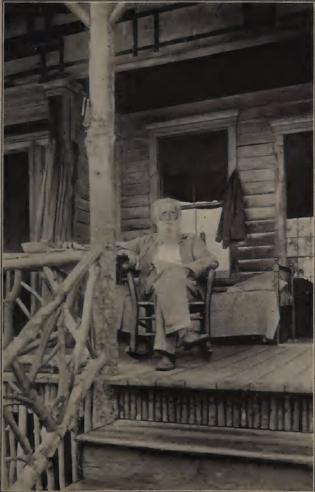
ON THE PORCH AT WOODCHUCK LODGE